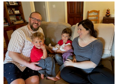
Lemaire family on Palmer's first day home.