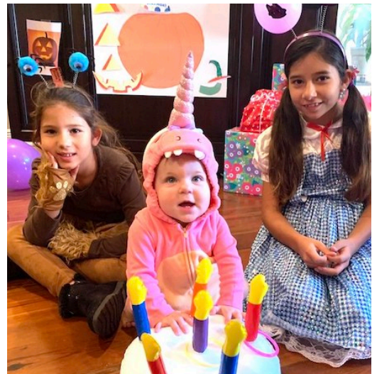
Lion, Unicorn, and Dorothy at Halloween