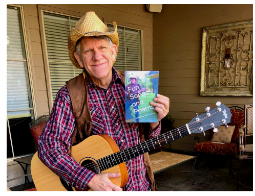
Fun Songs and Poems