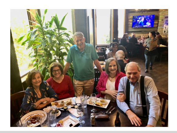
Zella's five dining at Don's

We took formal portraits, but informally at the Country.